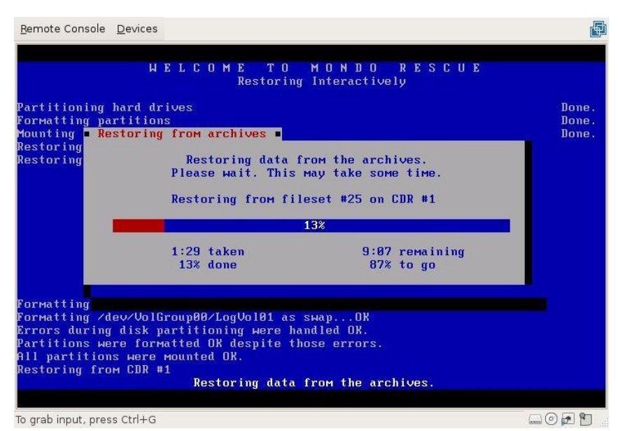
Figure 5: Restoring data

Once the format is completed successfully (errors would be displayed), MondoRescue will ask whether you'd like all of your data restored. Select 'Yes' to begin the restoration.