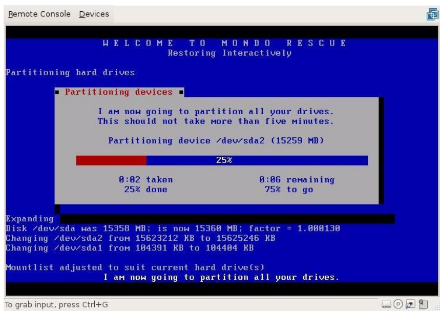
Figure 4: Partitioning devices

MondoRescue will then ask if you definitely want to erase and format the disks, select 'Yes'. Once the countdown has finished, MondoRescue will begin to partition your drives.