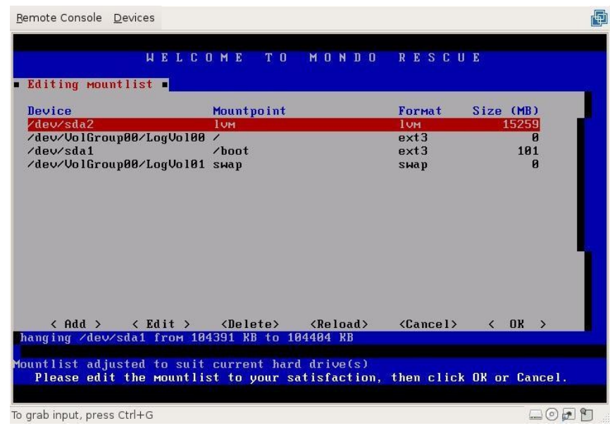
Figure 3: Editing mountpoints

Figure 3 shows that MondoRescue has picked up the correct sizing for the partitions given the size of the new disk, it will alter any sizes by comparing the size of the new disk and the size of the old and altering proportionally. Check to ensure the mountpoints are correct and select 'OK' to proceed. Say 'Yes' to any warning messages if you know the mountlist is correct.