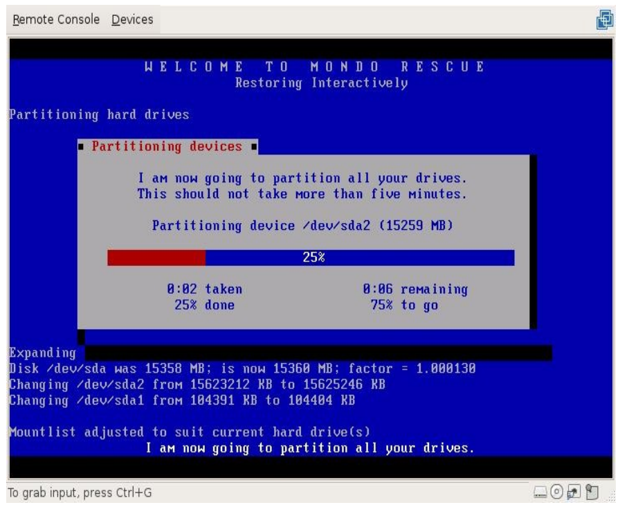
Figure 4 - Partitioning of devices

MondoRescue will then ask if you definitely want to erase and format the disks, select 'Yes'. Once the countdown has finished, MondoRescue will begin to