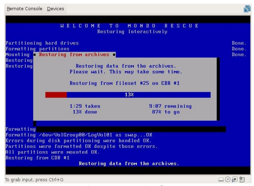
Figure 5 - Restoring data

Once the format is completed successfully (errors would be displayed), MondoRescue will ask whether you'd like all of your data restored. Select 'Yes' to begin the restoration.